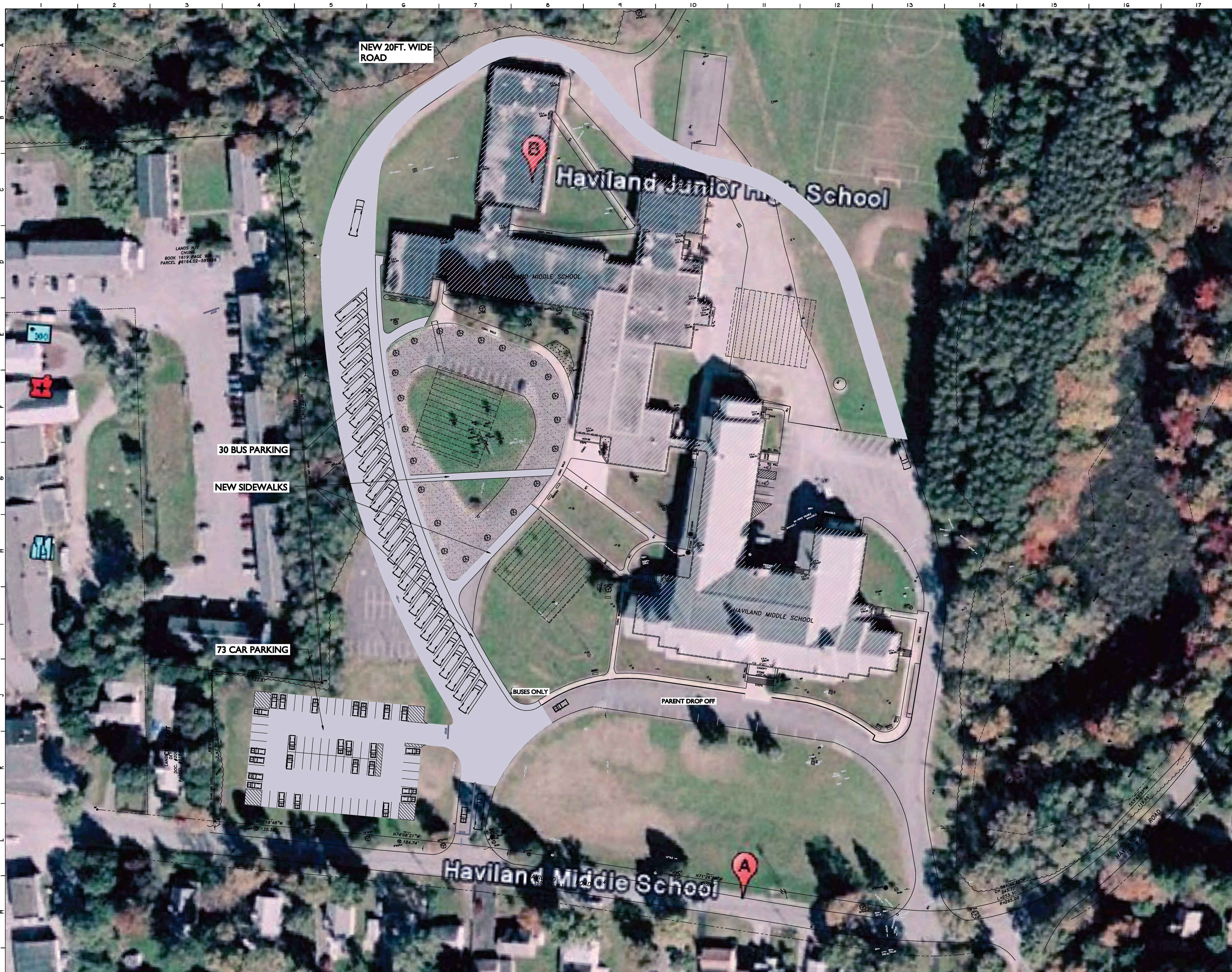
Hyde Park-Haviland Middle School 1"=40'-0"